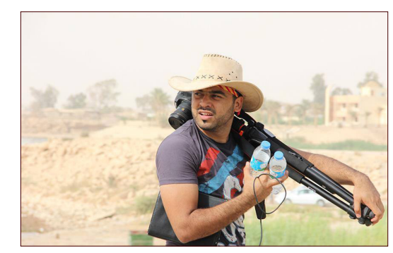
Potographer is carring water after a high tepmreture weather