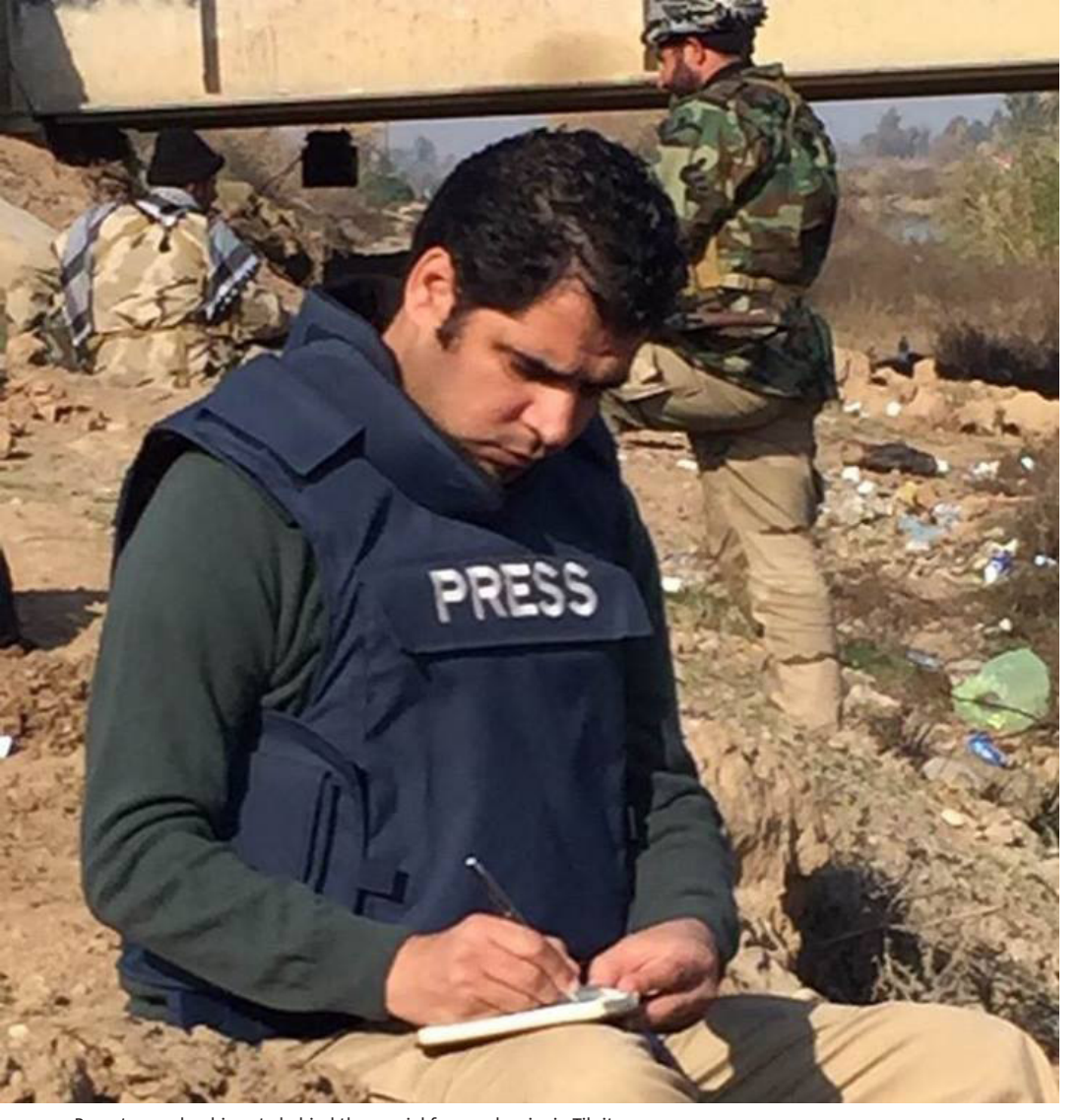
Reporter markes his note behind the special forces's barrier in Tikrit