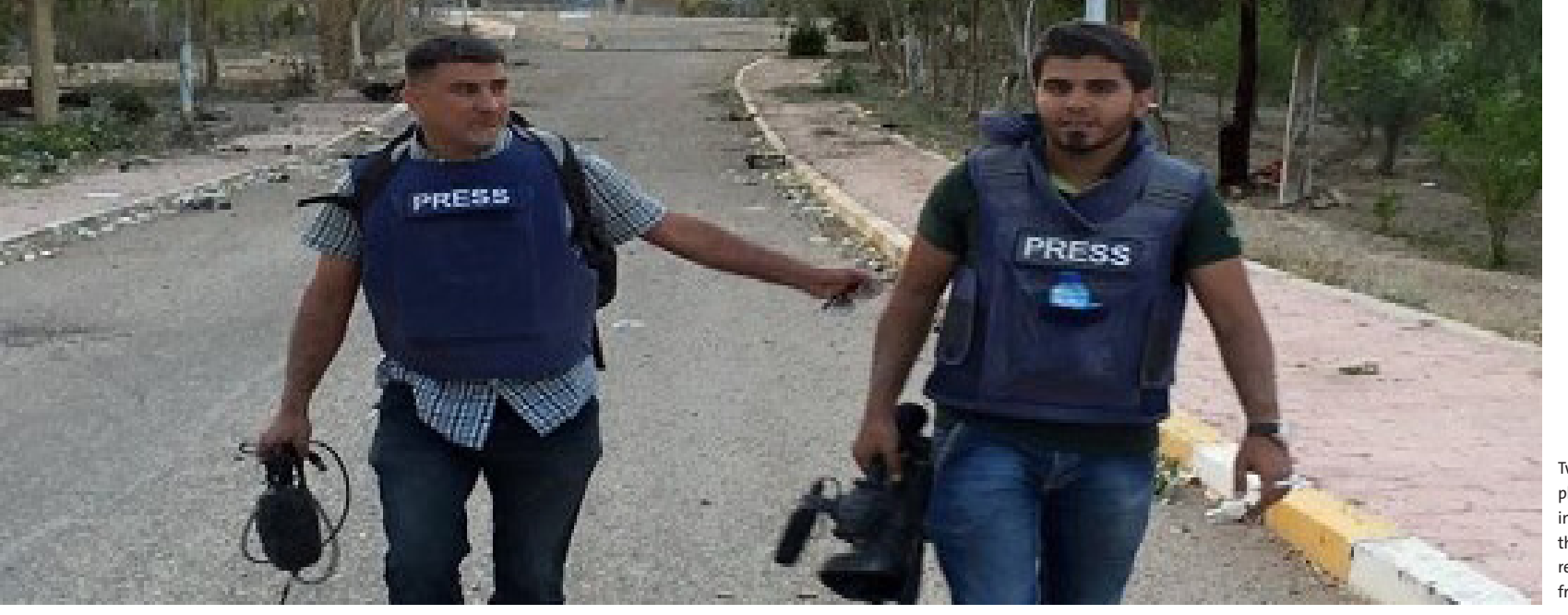
Two photorgraphars in Tikrit during the battale to retake the city from ISIS

dia outlets and it closed local and Arab satellite TV offices, like (Al-Baghdadia, Al-babeliya, Al-Arabiya and Al- Arabiya-al- Hadath, as well as Al-Jazeera, and Asharq Al Awsat newspaper).